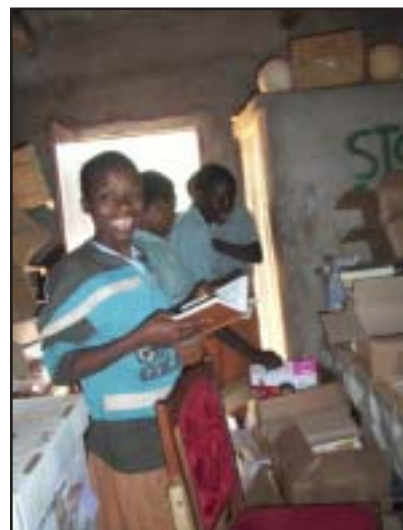
(Above) A young Kenyan boy holds a book donated by the Vicenza military community. (Right) Kenyan children pose outside their school.

Students in Talio, Kenya, enjoy books donated by the Vicenza military community in support of an initiative by the local Vicenza Press Volunteer Association (VI Press). Talio, a village about 150 miles from Nairobi, is where members of the VI Press are helping set up a free lending library in cooperation with the non-profit Kenya Voluntary Development Association that helps developing communities in rural Kenya.